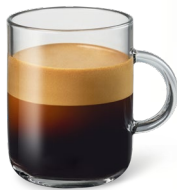
LARGE LONG BLACK