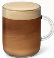
LARGE LONG BLACK WITH MILK