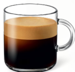
SMALL LONG BLACK