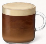
SMALL LONG BLACK WITH MILK